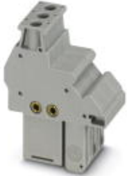
Plug, 3-pos. with integrated, automatic short circuit function

Please be informed that the data shown in this PDF Document is generated from our Online Catalog. Please find the complete data in the user's documentation. Our General Terms of Use for Downloads are valid ( http://download.phoenixcontact.com )