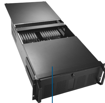
Dual top cover design for easy maintenance