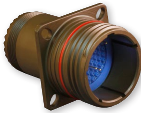
Receptacle Front View