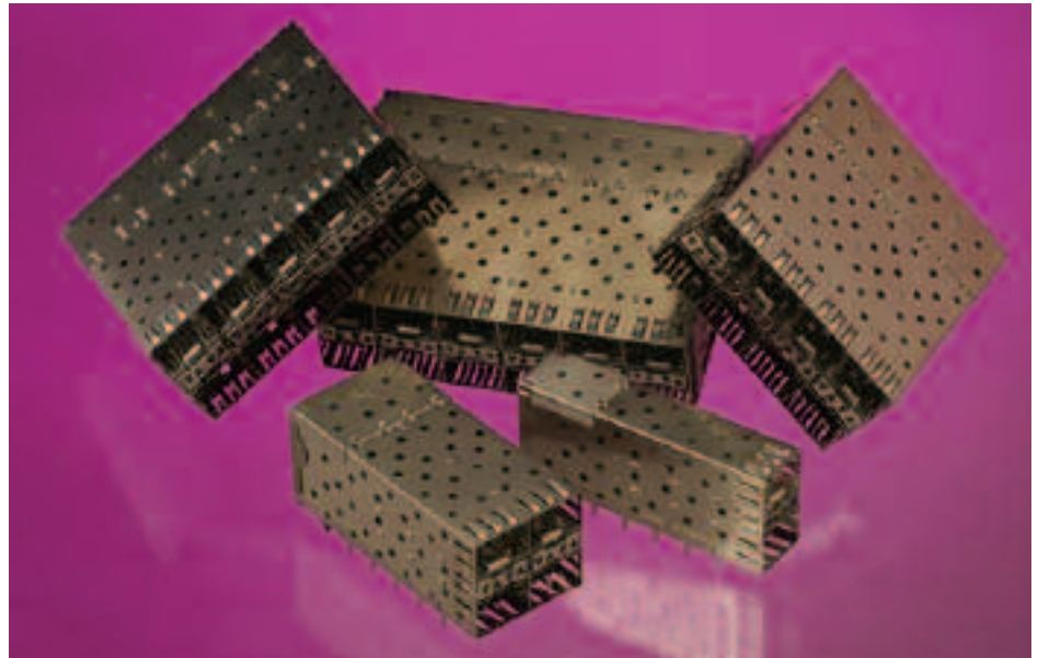
Multi-port connectors with lightpipes