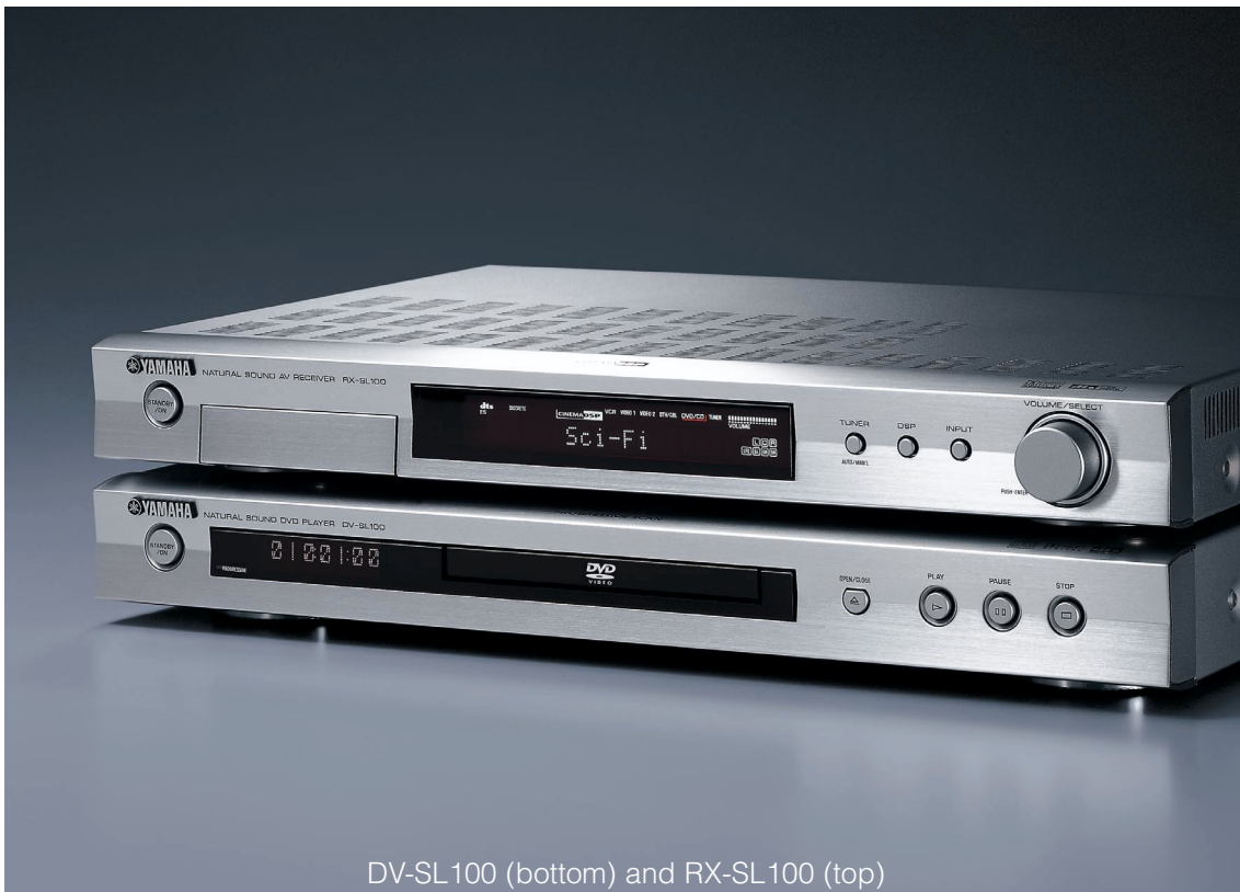
DV-SL100 (bottom) and RX-SL100 (top)

The slim silhouette is designed to match the thin styling motif of flat-screen plasma and LCD monitors. Used with other slim-line components, such as the Yamaha RX-SL100 Receiver, it gives you a uniquely fashionable home theater system.