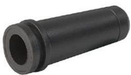
HN 14.109 PVC Strain Relief