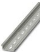
DIN rail perforated, acc. to EN 60715, material: Steel, galvanized, passivated with a thick layer, Standard profile, color: silver

DIN rail perforated - NS 35/ 7,5 PERF 2000MM - 0801733