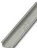
DIN rail, unperforated, acc. to EN 60715, material: Steel, galvanized, passivated with a thick layer, Standard profile, color: silver

DIN rail, unperforated - NS 35/ 7,5 UNPERF 2000MM - 0801681