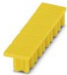
Cover for actuation shaft, 5-pos., for spring-cage terminal blocks with width of 5.2 mm