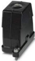
HEAVYCON B10 sleeve housing, HPR series, with screw locking, with M25 thread, straight outlet, for increased environmental and EMC requirements

Please be informed that the data shown in this PDF Document is generated from our Online Catalog. Please find the complete data in the user's documentation. Our General Terms of Use for Downloads are valid ( http://phoenixcontact.com/download )