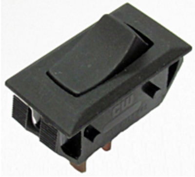
Item # GRS-2011B-3002, 2000 Series Momentary Full Size Rocker Switches

Email: info@cwind.com • Website: http://www.cwind.com