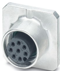
Sensor/actuator flush-type connector, 8-pos. socket, M12, A-coded, front/square flange mounting, wave soldering

Please be informed that the data shown in this PDF Document is generated from our Online Catalog. Please find the complete data in the user's documentation. Our General Terms of Use for Downloads are valid ( http://phoenixcontact.com/download )