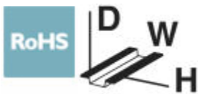
Figure shows PLC-BSC-120UC/21-21/SO46 version

14 mm PLC basic terminal block for high continuous currents with push-in connection, without relay or solid-state relay, for mounting on DIN rail NS 35/7,5, 1 PDT, input voltage 12 V DC