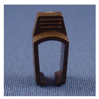
Rear-Mount Side-Mount Removal Clip