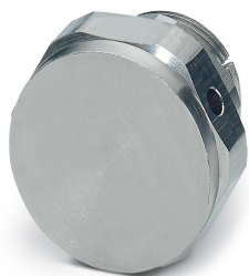
Pressure compensation element, material: Brass, nickel-plated, application: Ex, connecting thread: M20 x 1.5, color: silver

Please be informed that the data shown in this PDF Document is generated from our Online Catalog. Please find the complete data in the user's documentation. Our General Terms of Use for Downloads are valid ( http://phoenixcontact.com/download )