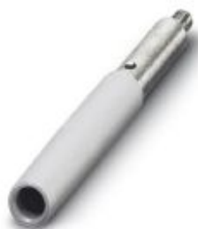
Female test connector, color: gray

Please be informed that the data shown in this PDF Document is generated from our Online Catalog. Please find the complete data in the user's documentation. Our General Terms of Use for Downloads are valid ( http://phoenixcontact.com/download )