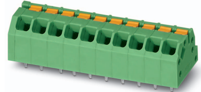
The figure shows 10-pos. standard item (without EX marking)

PCB terminal block, Push-in spring connection