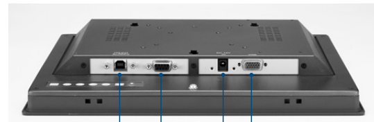
Touch Screen (USB) Touch Screen (RS-232) 100 ~ 240 V AC Power Adapter VGA Port