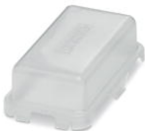
Protective covers, type: B10, degree of protection: IP20, color: transparent/white

Please be informed that the data shown in this PDF Document is generated from our Online Catalog. Please find the complete data in the user's documentation. Our General Terms of Use for Downloads are valid ( http://phoenixcontact.com/download )