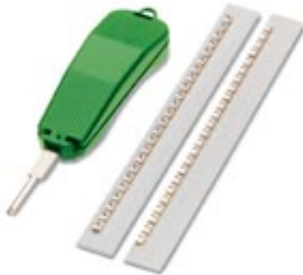
Alignment tool for cable markers, green, Unlabeled, Mounting type: Insert, Lettering field: 4 x 2.1 mm

Please be informed that the data shown in this PDF Document is generated from our Online Catalog. Please find the complete data in the user's documentation. Our General Terms of Use for Downloads are valid ( http://download.phoenixcontact.com )