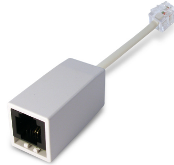
The in-line DSL nanoFILTER