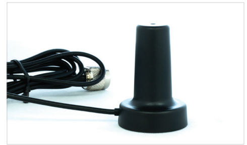
Image does not reflect the actual size of the antenna