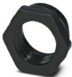
Reducing adapter, material: Polyamide fiberglass reinforced, connecting thread: M40 x 1.5, color: black, with flat gasket

Please be informed that the data shown in this PDF Document is generated from our Online Catalog. Please find the complete data in the user's documentation. Our General Terms of Use for Downloads are valid ( http://phoenixcontact.com/download )