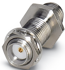
Antenna adapter for control cabinet feed-through, frequency range: 0.3 GHz ... 6 GHz, connection: 2 x SMA (female)

Please be informed that the data shown in this PDF Document is generated from our Online Catalog. Please find the complete data in the user's documentation. Our General Terms of Use for Downloads are valid ( http://phoenixcontact.com/download )