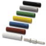
Insulating sleeve, Color: black

Insulation stop sleeve - ISH 2,5/0,2 - 3002843