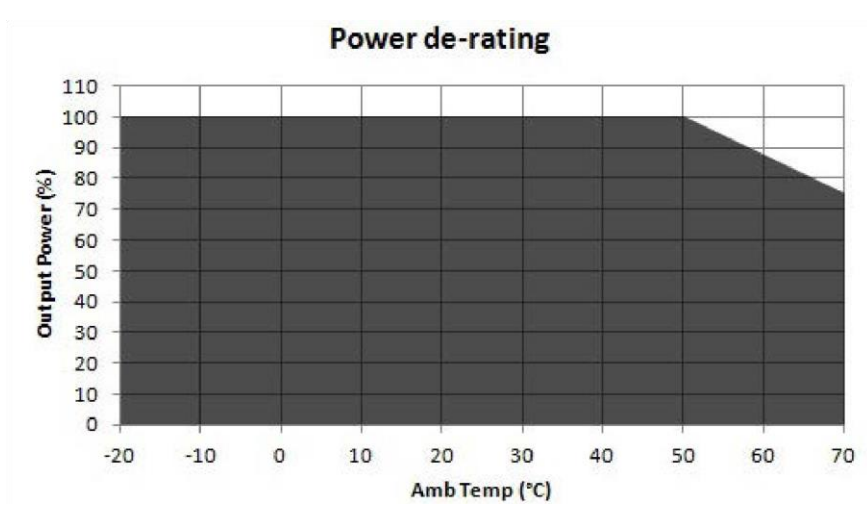
Figure 1. Derating Curve