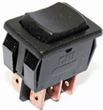
Item # GRS-4023A-1300, 4000 Series Center-Off Miniature Rocker Switches

Email: info@cwind.com • Website: http://www.cwind.com