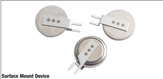
Surface Mount Device