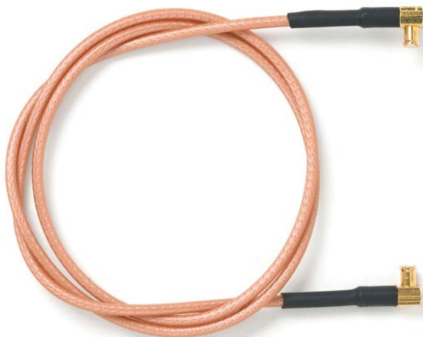
Model 73068 MCX Right-Angle Plug to MCX Right-Angle Plug, RG316/U

Snap-on coupling and miniature size for fast connect and disconnect where space is limited