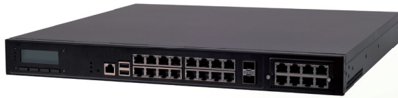
Images are for reference only. See ordering information for SKU details.

1U 19" Rackmount Network Appliance Built with Intel® Xeon® D-1500 4~16 Cores Processor (Codenamed Broadwell-DE)