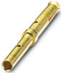
D-SUB crimp contact, connection method: Crimp connection, connection cross section: AWG 28- 22, High Density

Please be informed that the data shown in this PDF Document is generated from our Online Catalog. Please find the complete data in the user's documentation. Our General Terms of Use for Downloads are valid ( http://phoenixcontact.com/download )