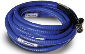
CASE STYLE: HW1388-10