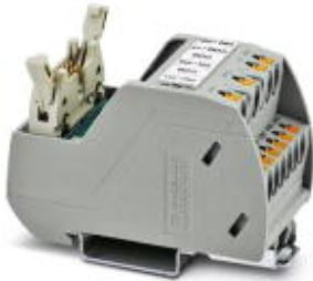
VARIOFACE Professional (VIP) board for the ROC800 controller

Please be informed that the data shown in this PDF Document is generated from our Online Catalog. Please find the complete data in the user's documentation. Our General Terms of Use for Downloads are valid ( http://phoenixcontact.com/download )