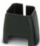
Color marking for patch cable, black

Color-coding - FL PATCH CCODE BK - 2891194