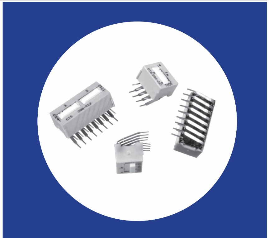
Series 206RA – Premium Gold Plated Contacts Series 208RA – Economical Tin Plated Contacts