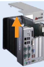
2. Withdraw the thumbscrew and remove the top cover