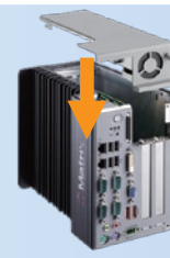
3. Replace it by plugging the hot-pluggable fan module cover into the fan connector on CPU board