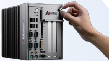
1. Undo the thumbscrew by hand