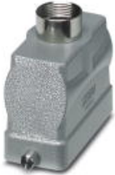
HEAVYCON sleeve housing B24, for single locking latch, height 76 mm, with support 1x M32, straight conductor exit

Please be informed that the data shown in this PDF Document is generated from our Online Catalog. Please find the complete data in the user's documentation. Our General Terms of Use for Downloads are valid ( http://download.phoenixcontact.com )