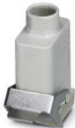
Coupling housing with single locking engagement nose, for HC-COM-K-KV-PG16...screw connection

Please be informed that the data shown in this PDF Document is generated from our Online Catalog. Please find the complete data in the user's documentation. Our General Terms of Use for Downloads are valid ( http://download.phoenixcontact.com )