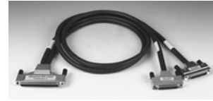
PCL-10250 100-Pin SCSI to Two 50-Pin SCSI Cable, 1 m