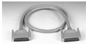
PCL-10162-1 DB62 Cable Assembly, 1 m