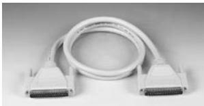
PCL-10137-1 DB37 Cable Assembly, 1 m