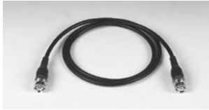
PCL-1010B-1 BNC to BNC Cable, Male, 1 m