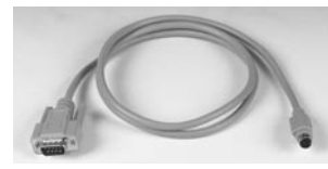
PCL-10901-1 DB9 to PS/2 Cable Assembly with Shielding, 1 m