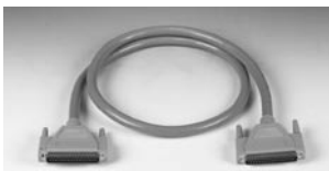
PCL-10137H-1 High-speed DB37 Cable Assembly, 1 m