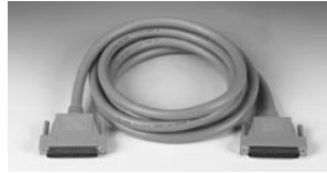
PCL-10137H-3 High-speed DB37 Cable Assembly, 3 m