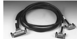
PCL-10250-2 100-Pin SCSI to Two 50-Pin SCSI Cable, 2 m