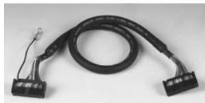
PCL-10121-1 20-Pin Shielded Cable, 1 m