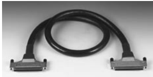
PCL-101100-1 SCSI Cable 100P Male 1m w/ Bolt Screw