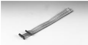
PCL-10120-1 20-Pin Flat Cable, 1 m