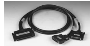
PCL-10251-1 100-Pin to Two 50-Pin SCSI Cable for PCI-1240, 1 m