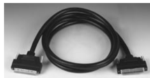
PCL-10168-2 68-Pin SCSI Cable, 2 m