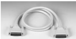
PCL-10125-1 DB25 Cable Assembly, 1 m