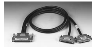
PCL-10268 100-Pin to Two 68-Pin SCSI Cable, 1 m