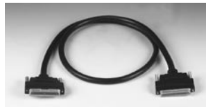
PCL-10168 68-Pin SCSI Cable, 1 m