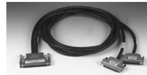
PCL-10268-2 100-Pin to Two 68-Pin SCSI Cable, 2 m