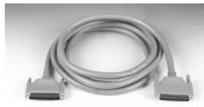
PCL-10162-3 DB62 Cable Assembly, 3 m