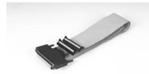
PCL-12250-1 100-Pin to Two 50-Pin Flat Cable for PCM-3240, 1 m