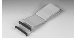
PCL-10150-1.2 50-Pin Flat Cable, 1.2 m