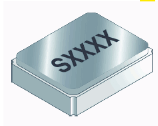
Outline (mm) SM1 = Gold Plated (RoHS)