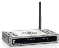
WBR-6003 150Mbps Wireless Router