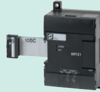
CP1W-SRT21 Inputs: 8 bits Outputs: 8 bits