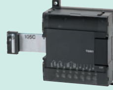
CP1W-TS001 Thermocouple inputs: 2 CP1W-TS002 Thermocouple inputs: 4 CP1W-TS101 Platinum-resistance thermometer inputs: 2 CP1W-TS102 Platinum-resistance thermometer inputs: 4