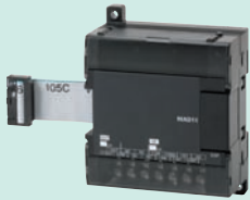
Analog I/O Unit CP1W-MAD11 Analog inputs: 2 (resolution: 6,000) Analog outputs: 1 (resolution: 6,000)