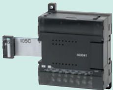
Analog Input Unit CP1W-AD041 Analog inputs: 4 (resolution: 6,000)