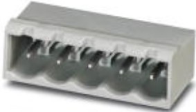
The figure shows a 5-pos. version of the product in gray

Header, Nominal current: 12 A, Rated voltage (III/2): 320 V, Number of positions: 17, Pitch: 5.08 mm, Color: black, Contact surface: Tin, Mounting: Wave soldering