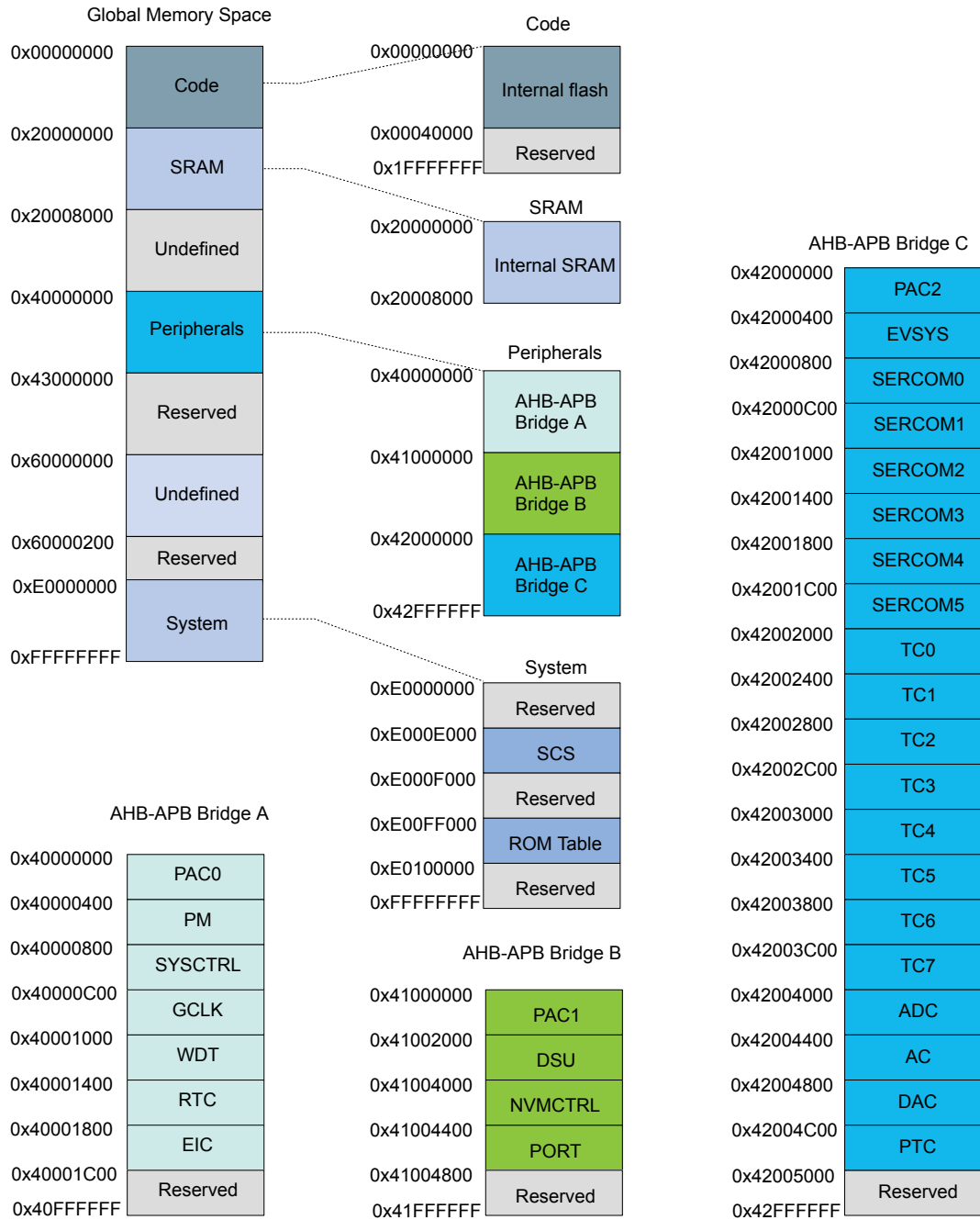
Figure 6-1. Product Mapping

This figure represents the full configuration of the SAM D20 device with maximum flash and SRAM capabilities and a full set of peripherals. Refer to the Configuration Summary for details.