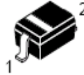
SOD-123 Flat Lead

These ratings are limiting values above which the serviceability of the diode may be impaired.