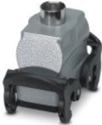
HEAVYCON B10 coupling housing, with double locking latch, height: 62 mm, with 1 x Pg16 gland, straight cable outlet

Please be informed that the data shown in this PDF Document is generated from our Online Catalog. Please find the complete data in the user's documentation. Our General Terms of Use for Downloads are valid ( http://phoenixcontact.com/download )