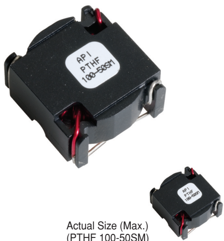
Actual Size (Max.) (PTHF 100-50SM)