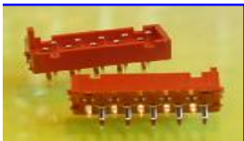
TMM-3 DIP Male.