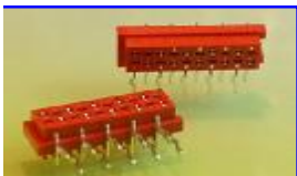
TMM-5 DIP Female R/A.