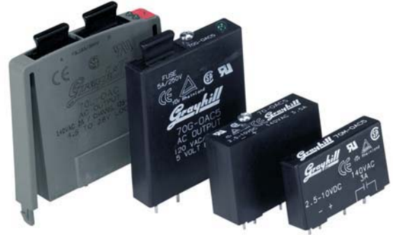
70L-OAC 70G-OAC 70-OAC 70M-OAC