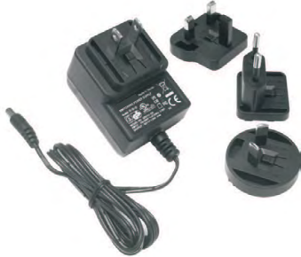
2.36" x 1.71" x 1.58"