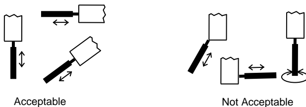
Figure 1 – Correct and Incorrect Angles of Measurement

Note: The sensing head with adapter must be in line with the object being measured. Avoid rotating the sensing head. Refer to the figure below.