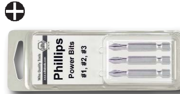
741 50 Phillips Power Bit Packs, 2" CVM

S2 modified tool steel. Extra hard with natural finish. Exact fit machined tips. 3 pc. bit pack.